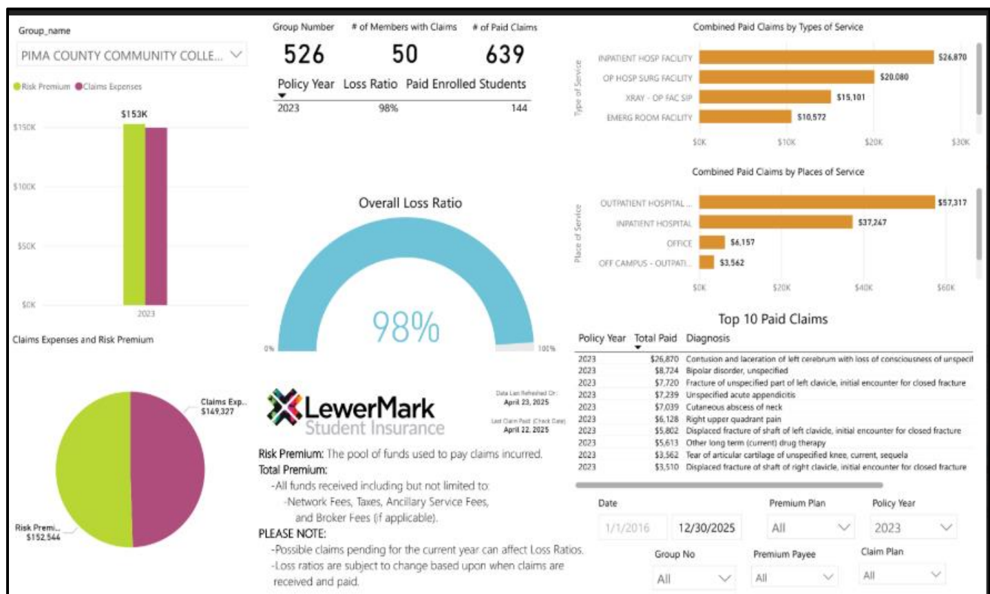
TABLE THREE (3)